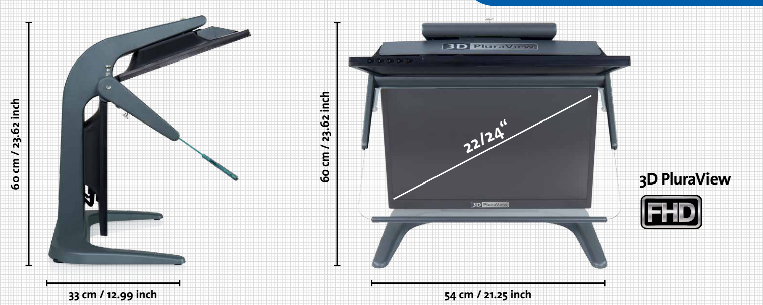
3D PluraView | Passive 3D-Stereo Monitors

3D PluraView supporting QuadBuffer Graphics Cards