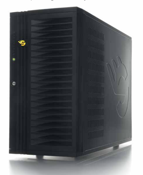
All our workstations feature additional sound isolation and customized (water) cooling solutions to maintain performance and minimize sound emissions.

We do not have just superficial knowledge about the main software applications for CAD, Photogrammetry or GIS, but work closely with many software manufacturers. We collaborate with them right up to the creation of meshed 3D city models, BIM, architecture designs, digital terrain models and in special tasks such as 3D point cloud editing and terrestrial photogrammetry.