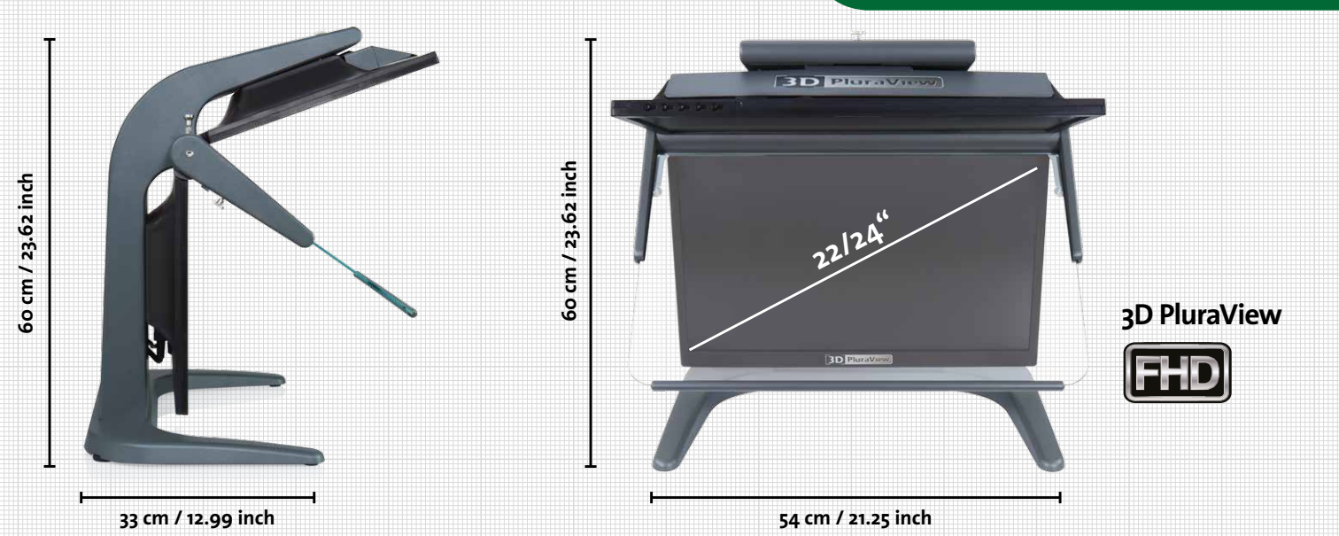
3D PluraView | Passive 3D-Stereo Monitors

3D PluraView supporting <u>QuadBuffer Graphics Cards</u>